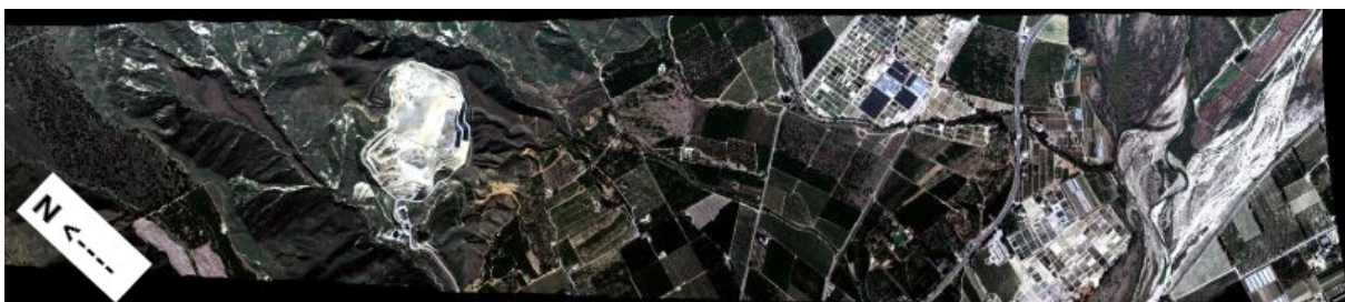
Figure 1. Portion of quicklook image for AVIRIS-NG flight ang20220228t214527 over Ventura County north of Santa Clara River west of Fillmore, California on 28 February 28 2022. Approximately 34.403 latitude, -118.990 longitude.

This dataset has a total of 404 data files. There are 202 binary ENVI files with 202 ENVI headers in text format.