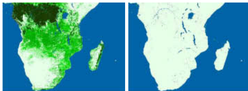
Percent broadleaf cover