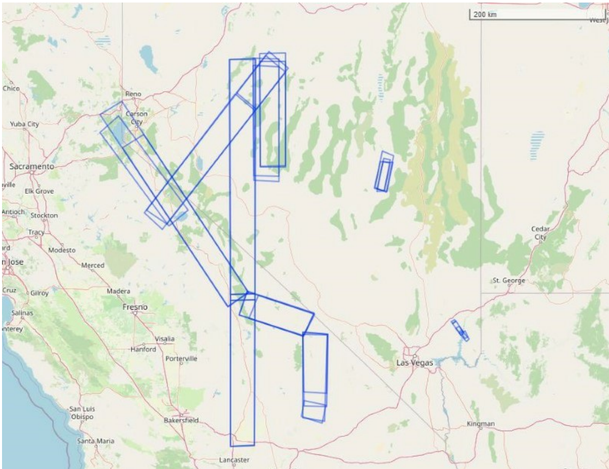
Figure 2. Flight tracks in this dataset represented as blue rectangular polygons over California and Nevada. Basemap: © OpenStreetMap contributors.

For this deployment, the MASTER instrument was flown on NASA's ER-2 aircraft at altitudes of 17,950 - 20,135 m above sea level. The B-200 flights were flown at altitudes of 2870 - 9790 m a.s.l.