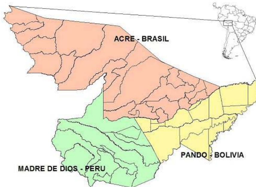
Figure 1: Region frontier of Madre de Dios-Peru, Acre-Brazil, and Pando-Bolivia, called MAP region.