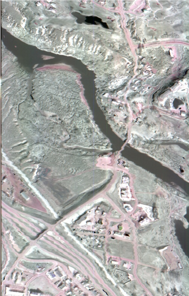
Figure 1. Portion of a false color image derived from HyTES radiance data from flight over Garfield, Colorado on 2022-03-15. Flight: GarfieldCO Line 1, 20220315t230313.