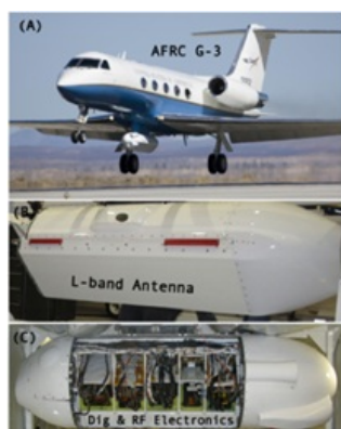
Figure 2. UAVSAR is flown on a Gulfstream-III aircraft, mounted in a pod hung below the fuselage.

UAVSAR is a polarimetric L-band synthetic aperture radar operating with 80 MHz bandwidth from 1217.5–1297.5 GHz designed for interferometry (InSAR) (Hensley et al., 2009). UAVSAR's swath width is 22 km, which illuminates an area from 22°–67° incidence angle, with 3 m (cross-track average) by 1 m (along-track) single look ground resolution. The instrument was flown on a Gulfstream-III (C20) aircraft with the radar electronics and antenna housed in a pod mounted below the fuselage (Fig. 2). Table 1 summarizes the acquisitions used to generate the interferometric products.