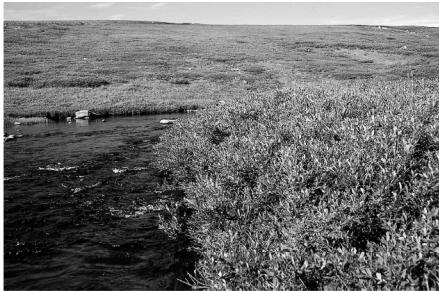
Fig. 12. The Valeriano-Salicetum pulchrae, here along the upper Kuparuk River, is common on paludified, acid banks of upland tundra streams and creeks in the Arctic Foothills, especially on older land surfaces