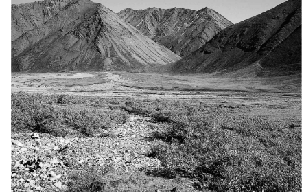
Fig. 9. Salix alaxensis -communities are not restricted to lowland river banks. As true pioneer communities they occupy gravelly montane stream banks in the Brooks Range, which might show only periodical streamflow (subass. poemonietosum acutiflorum). Stand productivity and vigor of Salix alaxensis is reduced