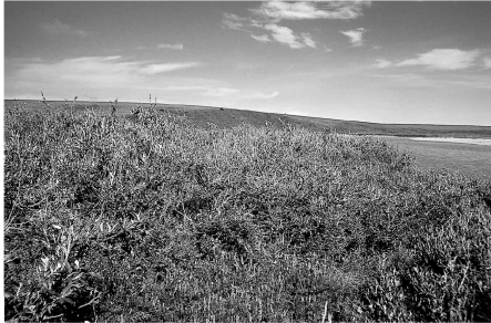
Fig. 3. The Epilobio-Salicetum alaxensis (subass. parnassietosum kotzebuei) is widely distributed on floodplains, gravel bars and lower terraces along the Sagavanirktok River