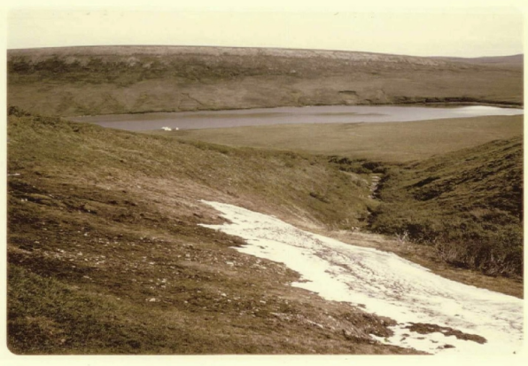
Figure 22. Salicetum pseudopolaris