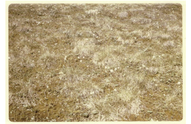
Figure 17. Betulo-Eriphoretum vaginati (betulo-eriphoretosum vaginati)