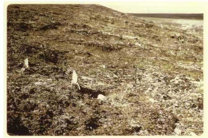
Figure 13. Betulo-Ledetum decumbentis (betulo-ledetosum decumbentis)