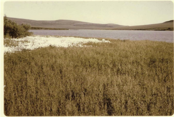
Figure 19. Arctophiletum fulvae