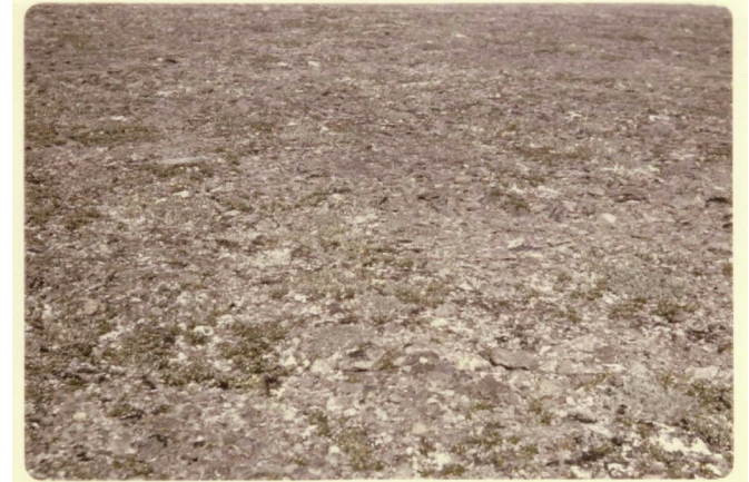
Figure 11. Lupino-Dryadetosum alaskensis (depauperatum)