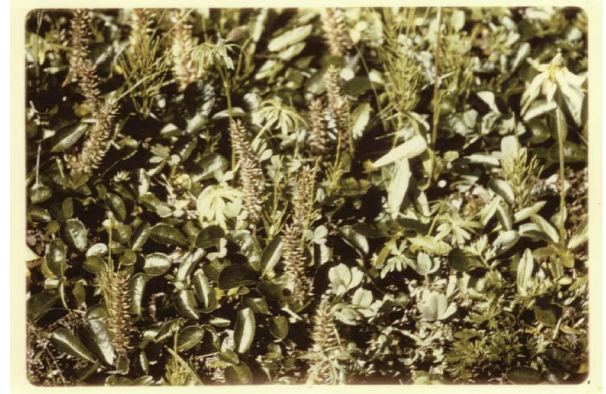
Figure 24. Salicetum chamissonis ( salicosum chamissonis )