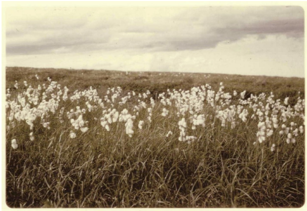
Figure 20. Eriophoretum angustifolii