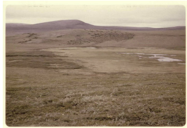
Figure 21. Caricetum aquatilis