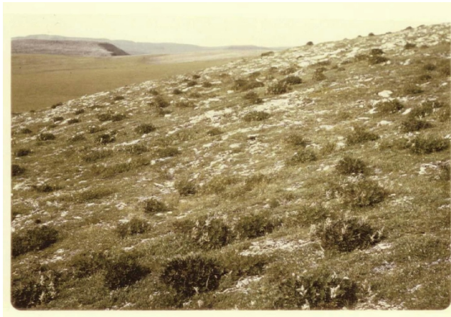
Figure 12. Lupino-Dryadetosum alaskensis (dryado-salicetosum reticulatae)