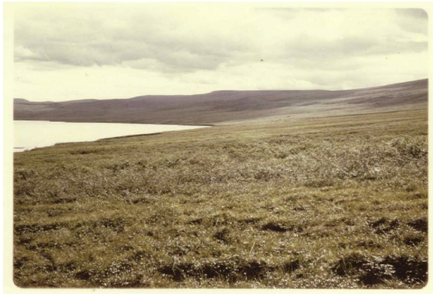
Figure 16. Vaccinio-Betuletum glandulosae (fruticosum)