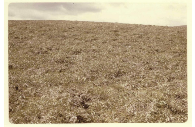
Figure 15. Vaccinio-Betuletum glandulosae (fruticulosum)