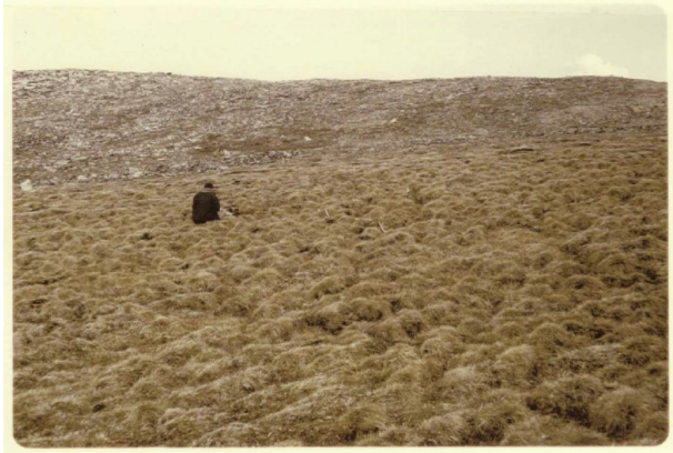
Figure 18. Betulo-Eriphoretum vaginati (salicetosum reticulatae)