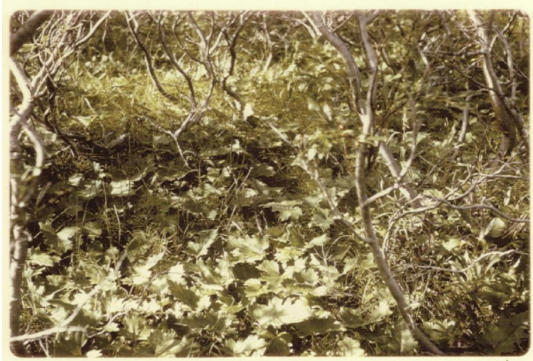
Figure 25. Salicetum pulchrae ( salicosum pulchrae )