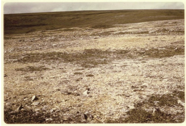
Figure 10. Salicetum phleobophyllae